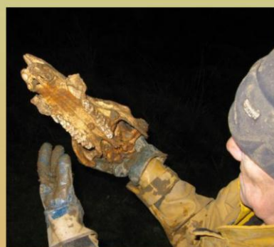
Wild boar skull found on the Cupcake dig