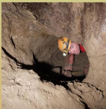
Inlet 8, Notts 2 – A dead end?