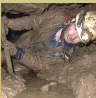
The joys of digging?